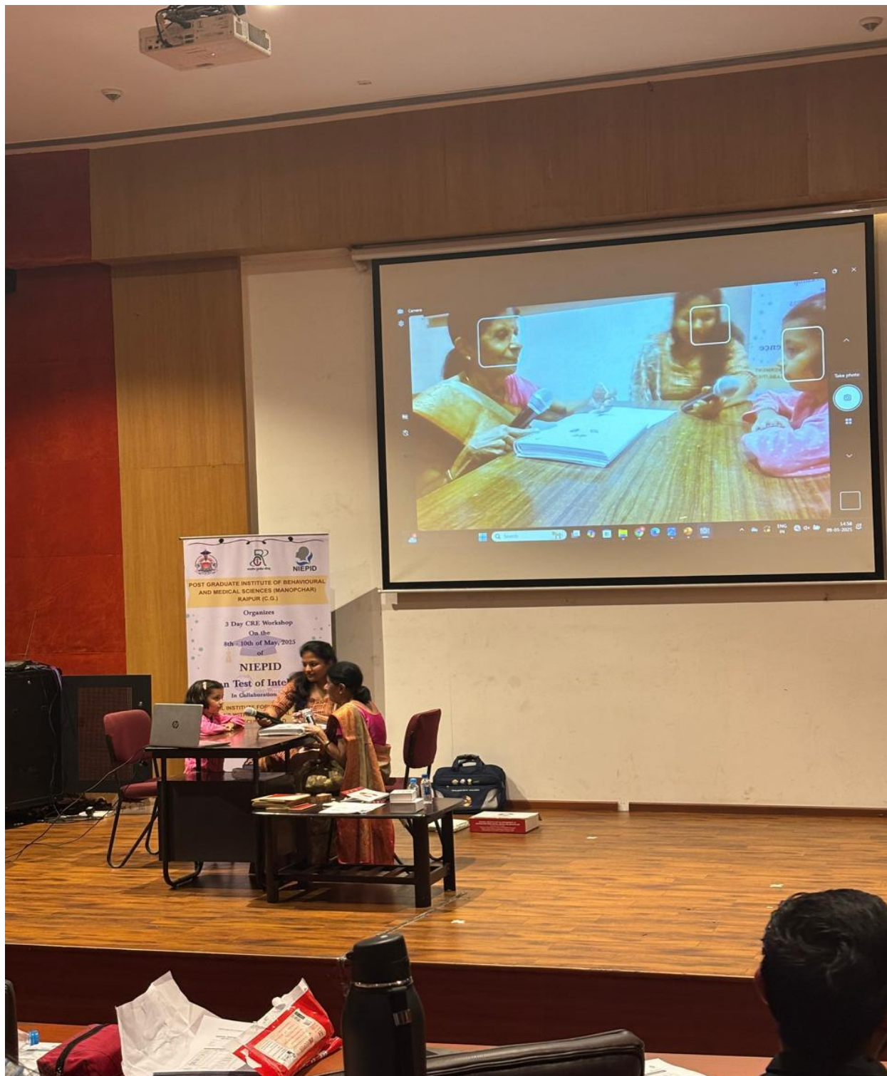
Live demonstration of the NIEPID test on a child without Intellectual Disability