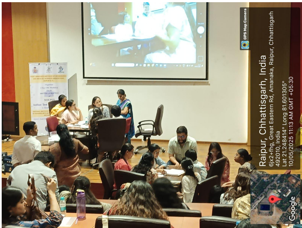
Hands on group demonstration of the NIEPID test