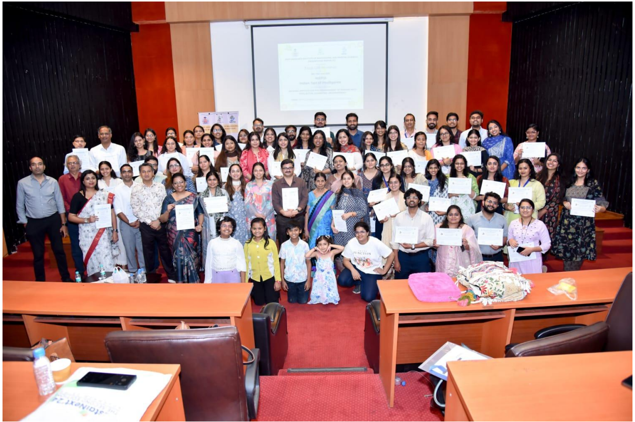
Conclusion of the 3 Day workshop program on NIEPID Indian Test of Intelligence