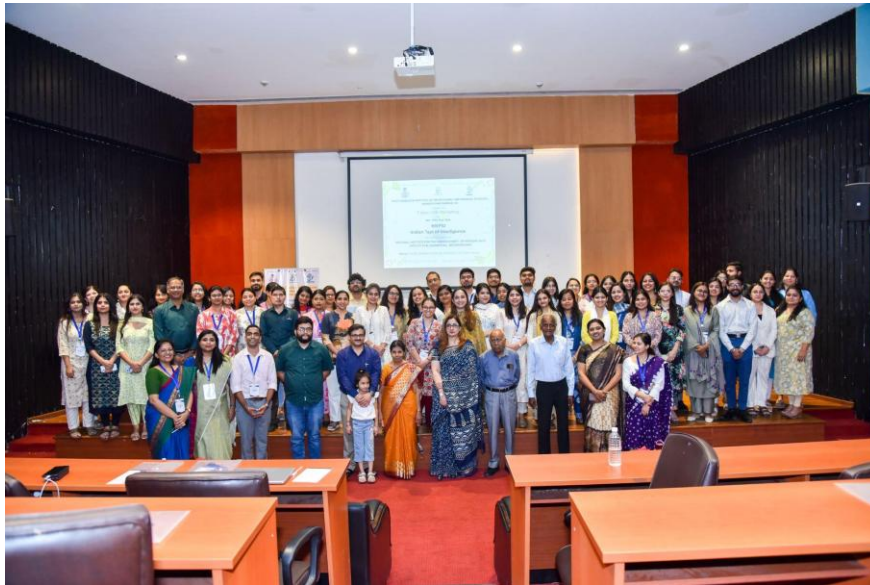
Participants, organisers and students after the successful completion of Day 1 of the workshop