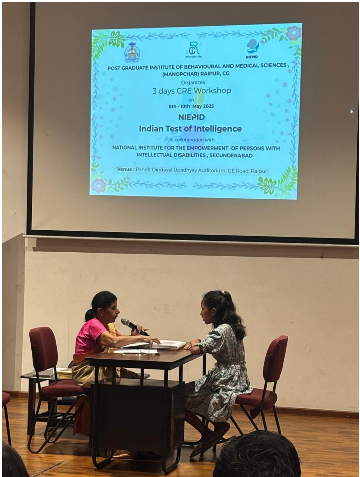
Live demonstration of the NIEPID test on a child with Intellectual Disability