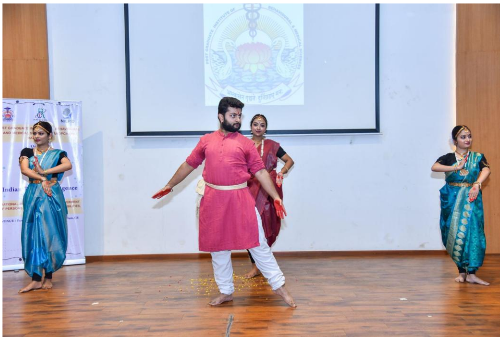
Cultural performance by students of PGIBAMS during Opening Ceremony