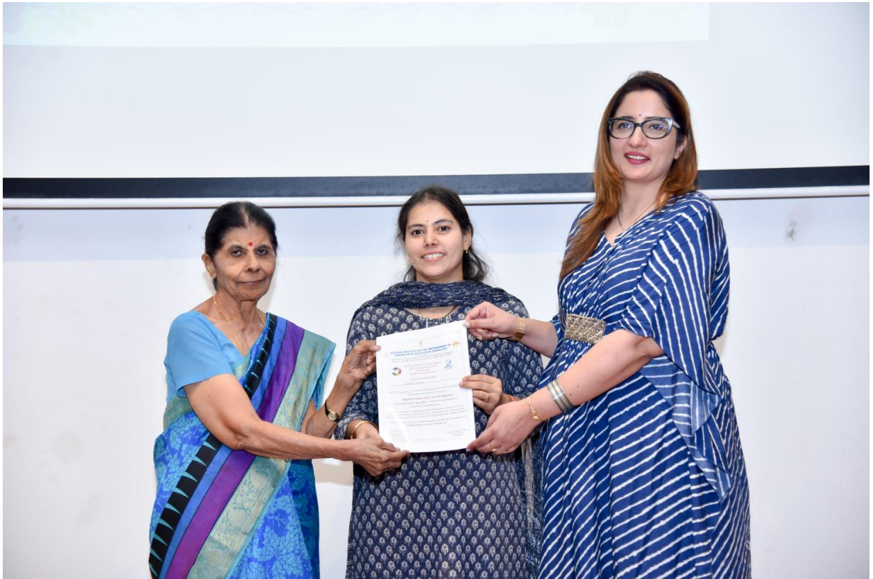
Certificate distribution ceremony for all CRE and Pre CRE registered participants